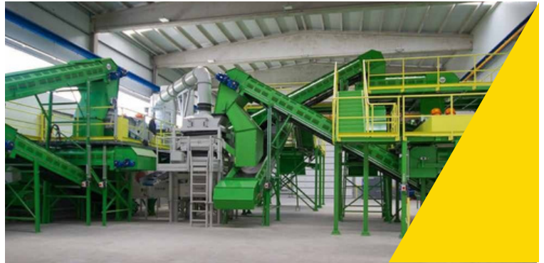
Full-scale testing facility available to any PICVISA client.